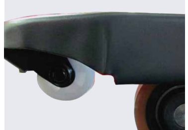
Easy access to the tray rack, auxiliary uphill, avoid damage